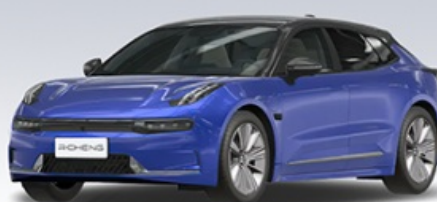
● DARK BLUE