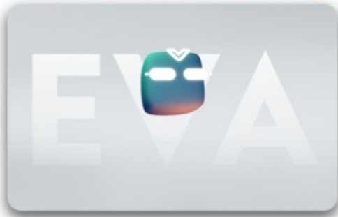
▲ AI Mate Intelligent assistant