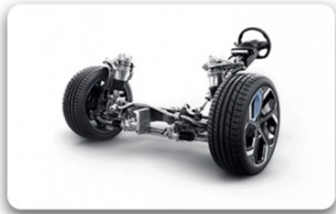
▲ High-performance chassis system